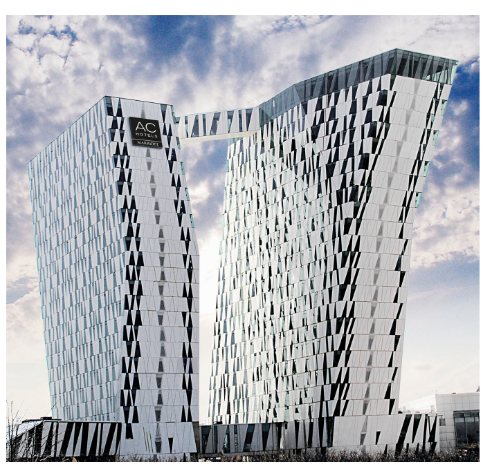
Bella Sky Hotel, Copenhagen

When available a list of hotels will be placed on the website.